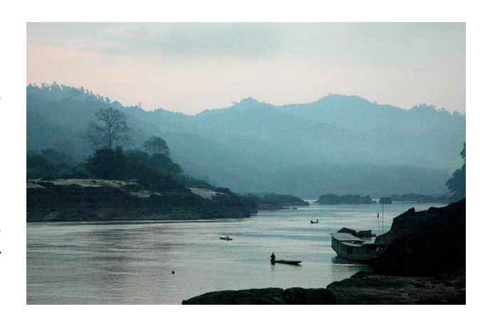
Site of the proposed Xayaburi Dam

(http://www.bangkokpost.com/news/investigati on/234766/a-new-geopolitics-of-mekong-dams), based on concerns expressed both in technical reviews of the dam proposals and a series of public consultations, at which strong opposition to Xayabouri and other mainstream dams was expressed. The matter was referred upward to the Ministerial Council level, effectively putting the dam in abeyance.