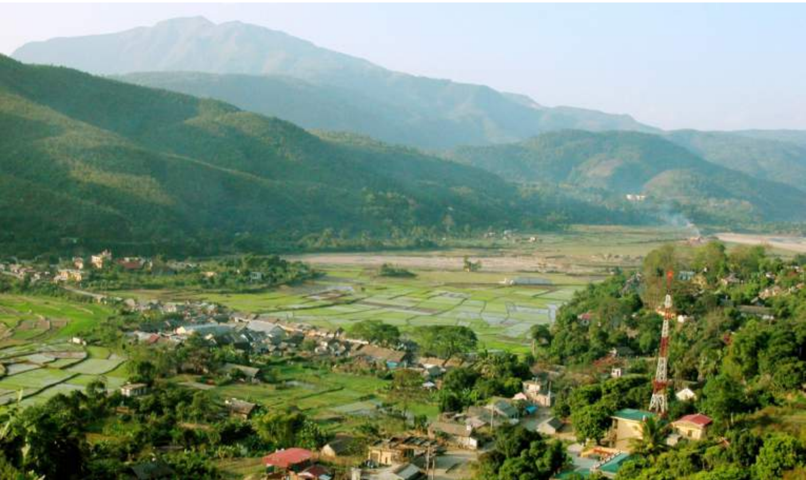
A village flooded by the reservoir of the Son La dam.

Vietinbank's reach extends beyond Vietnam. The bank has lent billions of dollars to Electricity Vietnam, which is part owner of a highly controversial dam in Cambodia, Lower Sesan 2, which will pro-