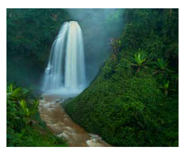
The Kisiizi Falls flows into the Kisiizi River in Uganda.