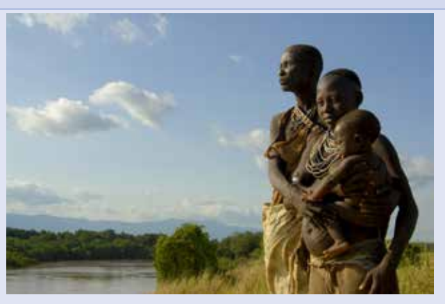
Three Generations of Women Looking Out Over the Omo River.

According to Human Rights Watch, Ethiopian government security forces have committed various human rights violations against indigenous communities in the Lower Omo Valley during the construction of the Gibe 3 Dam and clearing out settlements to make way for sugarcane plantations that would be irrigated with water diverted from the river just below the dam. The report, "What Will Happen When Hunger Comes? Abuses Against the Indigenous Peoples of Ethiopia's Lower Omo Valley," found in 2011 that "local government and security forces had carried out arbitrary arrests and detentions, used physical violence, and seized or destroyed the property of indigenous communities. Residents said military units regularly visited villages to intimidate residents and suppress dissent related to the sugar plantation development. According to local people anything less than fully expressed support for plantation development was met with beatings, harassment, or arrest. In addition several agro-pastoral communities in the Lower Omo told