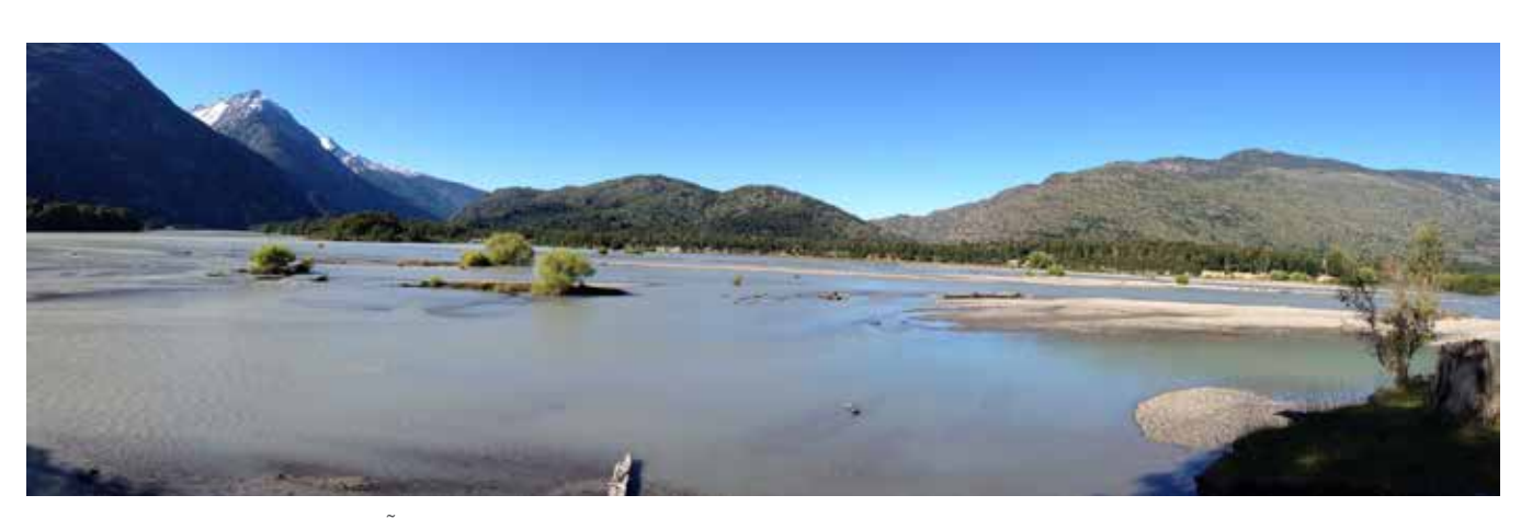
The confluence of the Baker and Ñadis Rivers, in Chilean Patagonia.