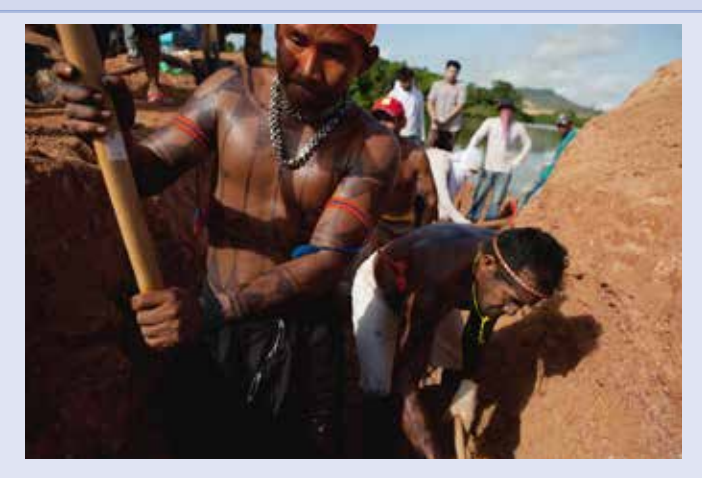
Indigenous protesters dig through the Belo Monte coffer dam to allow the Xingu River to flow freely.

Further, Eletrobras' implementation of mitigation activities and compensation was highly incomplete. The Brazilian