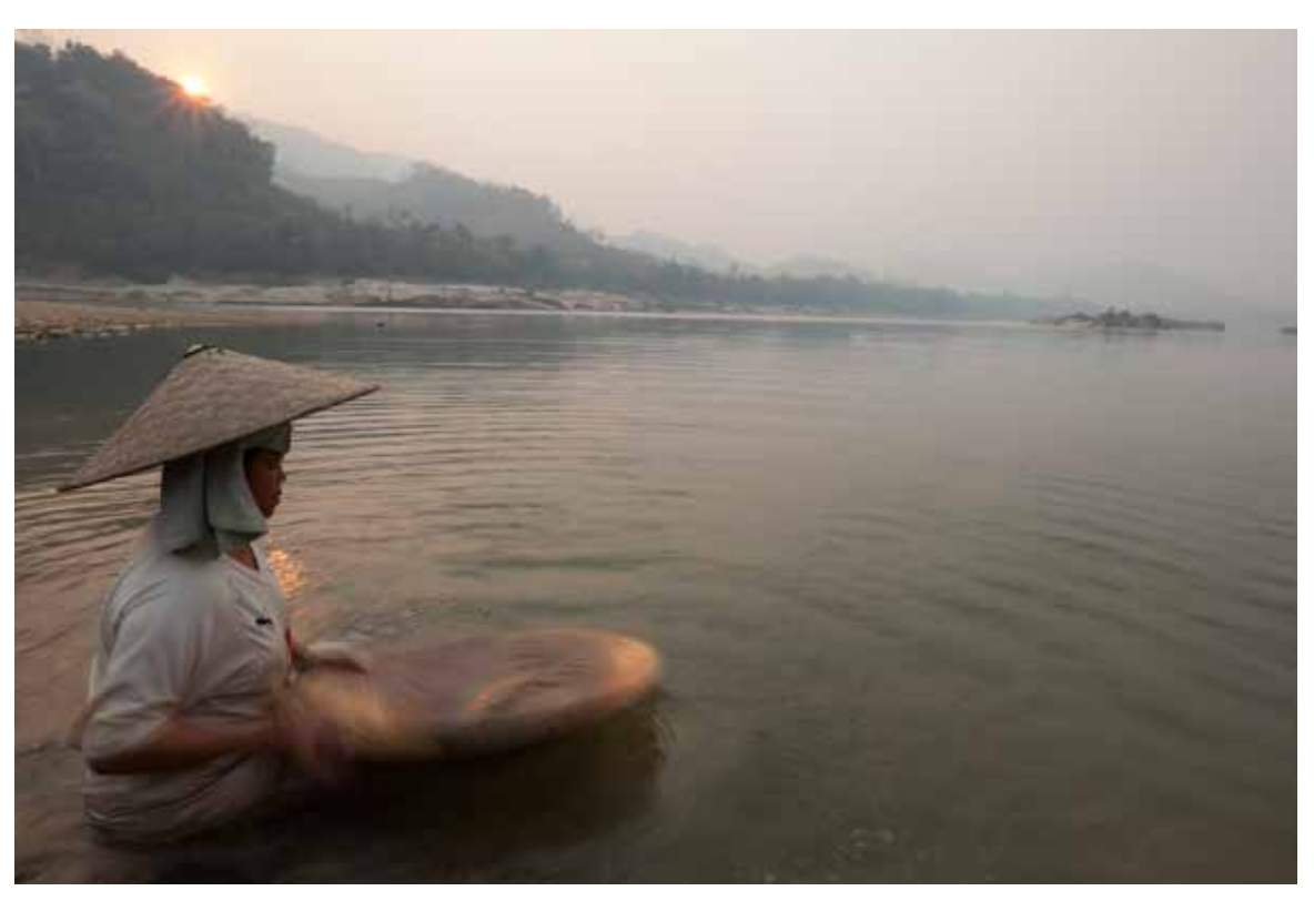
A Lao Theung woman in Ban Huay Song panning for gold in the Mekong River near Kaeng Luang.