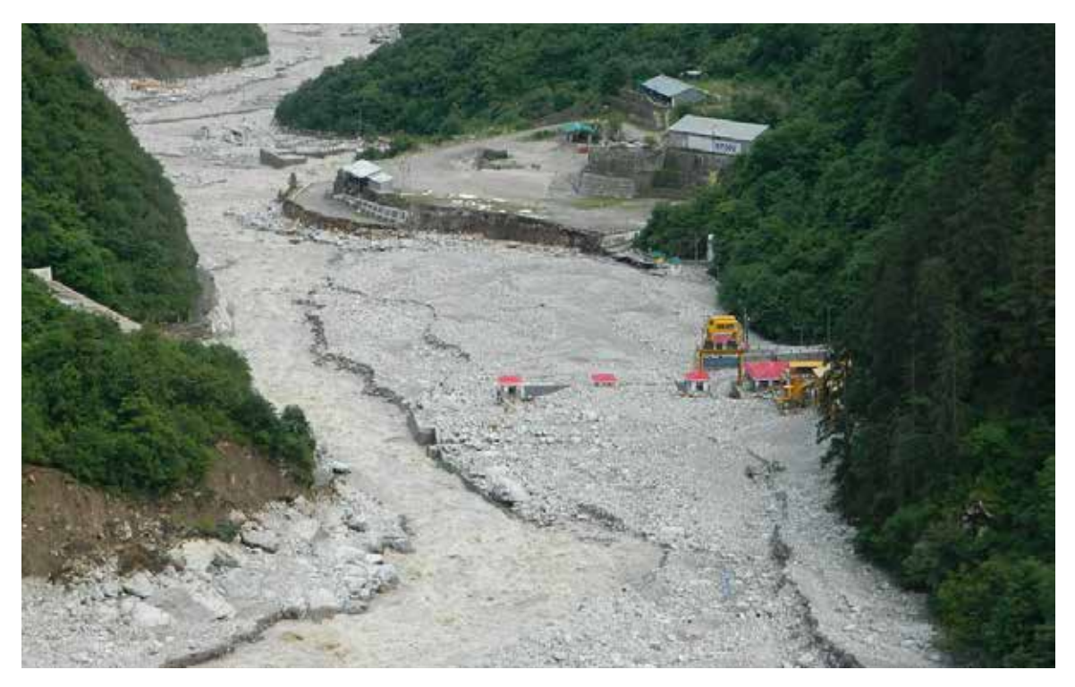
Severe flash floods swept through the Northern Indian state of Uttarakhand in June 2013 as a result of climate change, destroying several hydropower projects including the Vishnuprayag Dam, shown here.

Dam infrastructure can also emit greenhouse gases, including reservoir emissions, spillway emissions, emissions associated with project construction, and others. For these reasons, all greenhouse gas emissions