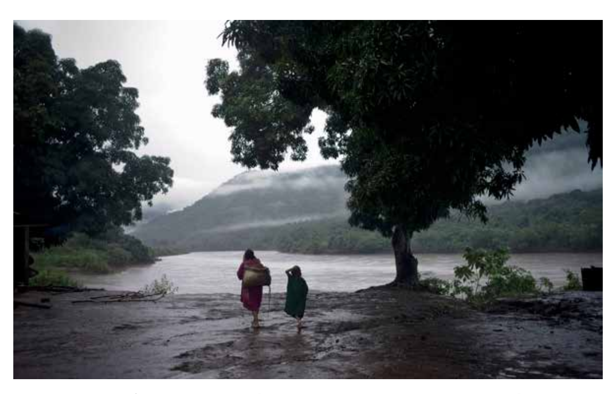
The Ashaninka women of Tsiquireni, near the Ene River, in the Peruvian Amazon.

By utilizing social and environmental standards to push for better outcomes across all stages of dam building - from planning to construction to mitigation, to decommissioning and reparations - you may be able to change the particular outcomes of a project; you may influence the long-term direction of policies; and you may even transform an industry.